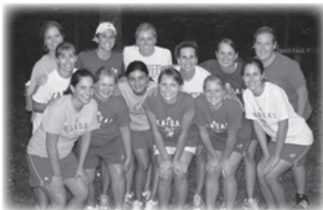
Kansas golfers and friends