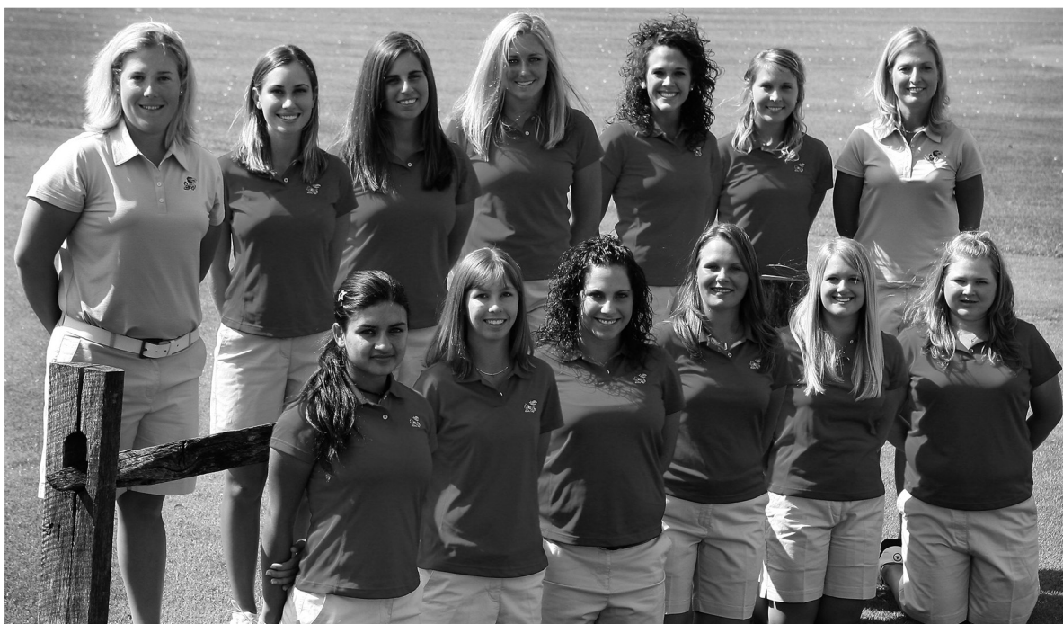
2007-08 KANSAS WOMEN'S GOLF TEAM