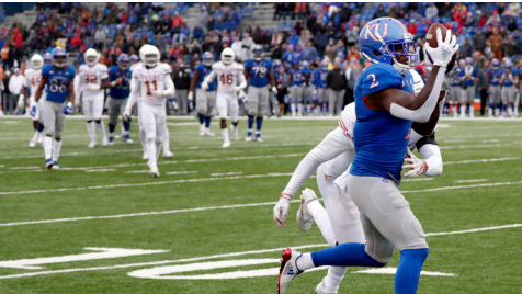
NOV. 23, 2018 | DAVID BOOTH KANSAS MEMORIAL STADIUM | LAWRENCE, KAN.