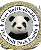
Oreo's GAME CHAIN (PLAY OF THE GAME)