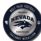
TAKEAWAY MEDALLION (OMNIA PRO PATRIA)