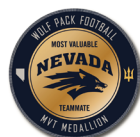
MVT MEDALLION (MOST VALUABLE TEAMMATE)