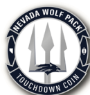
TOUCHDOWN COIN (MINOR)