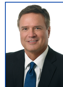
BILL SELF Head Coach 21st Year at Kansas