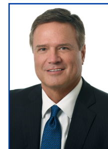
BILL SELF Head Coach 21st Year at Kansas